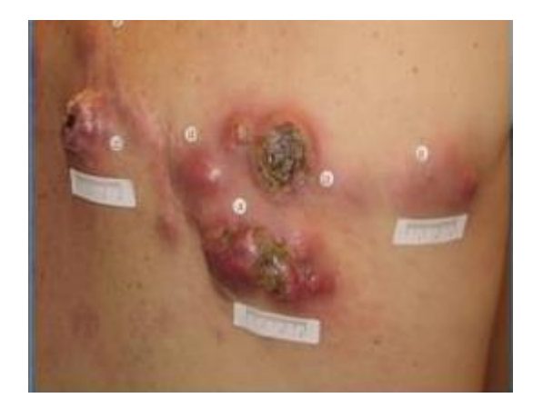
Prior to treatment